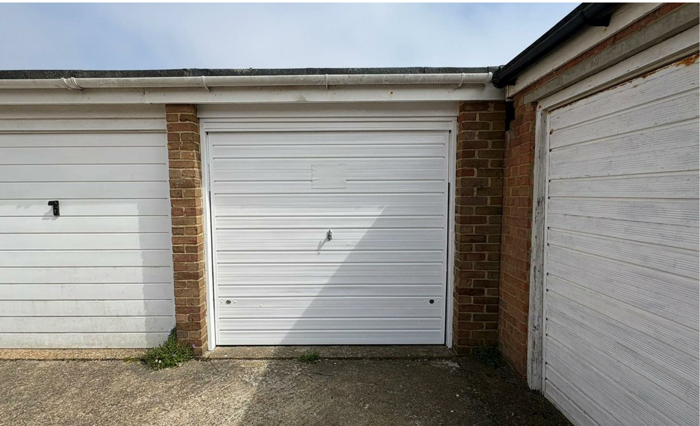
Garage, Richardson Court, Richardson Road, Hove, BN3 5RB Asking price £38,000